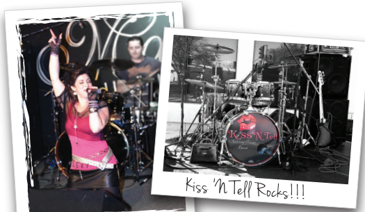
80's Dance Party - Marylin's on K. Sac