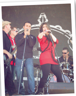
Lights, Camera, Rock 'n Roll